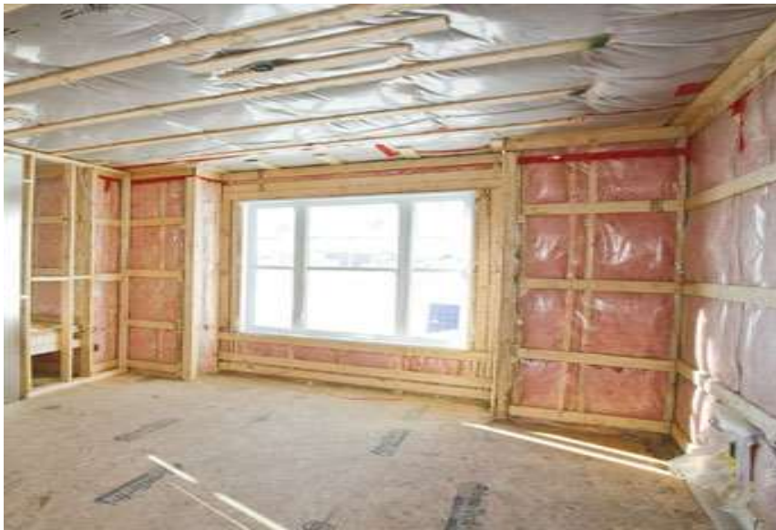
At the proper moment