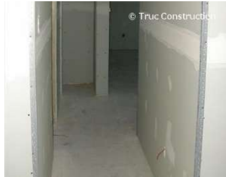
At the wrong one