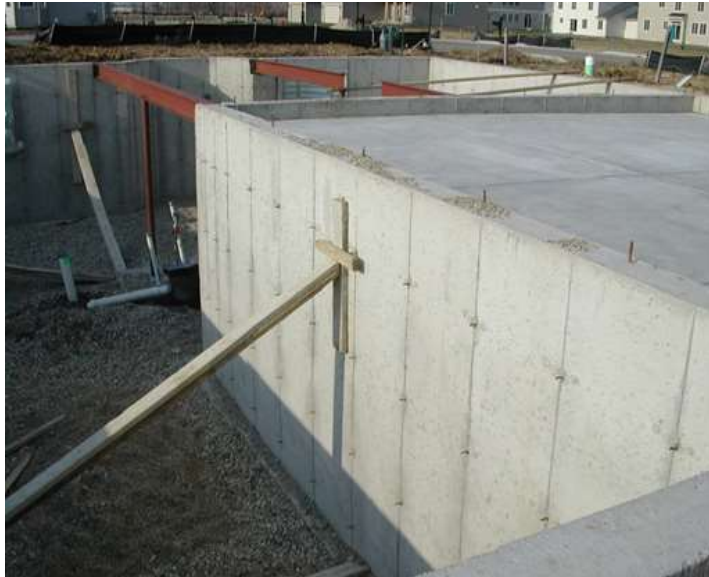
At the right moment