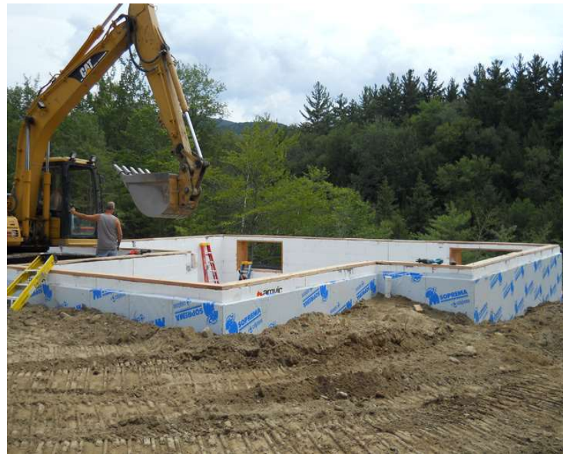
At the wrong one